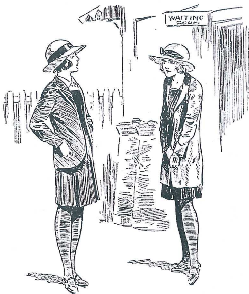
The girl regarded Pen disdainfully. "I suppose," she said at length, "that you are the new servant?"